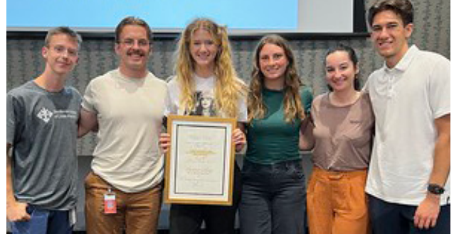
Golden Heart Winner 2025 Sherman College of Chiropractic