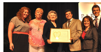
Parker University, student and staff